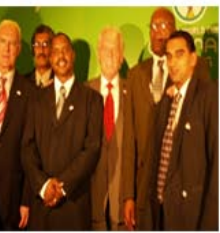
With the greats!

This undoubtedly was an experience that I can describe as one which allows me to die and go to heaven with the feeling of having fulfilled an experience that will be incomparable to none other.