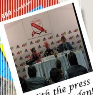
With the press before Sweden!